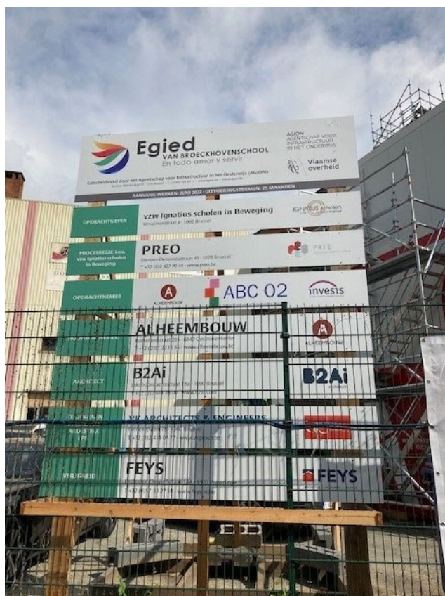
Site signage showing the members of the educational partnership