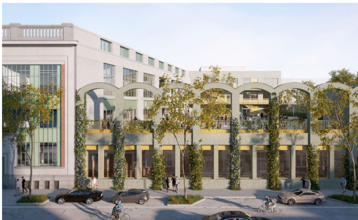
The façade of the new school