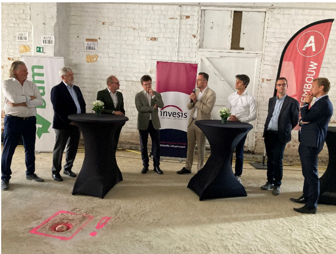
Laying the foundation stone for the new school