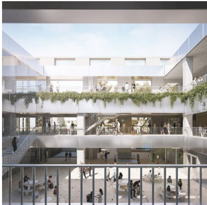
The patio garden encourages informal open-air gatherings